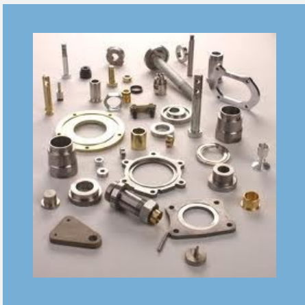
Precision Machining Parts