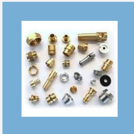
Precision Forging Components