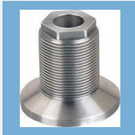
CNC Machining Components