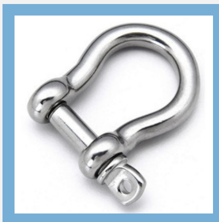
Transmission Forged Parts