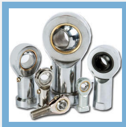
Automobile Forged Parts