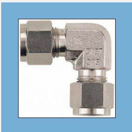
Hydraulic Forged Fittings